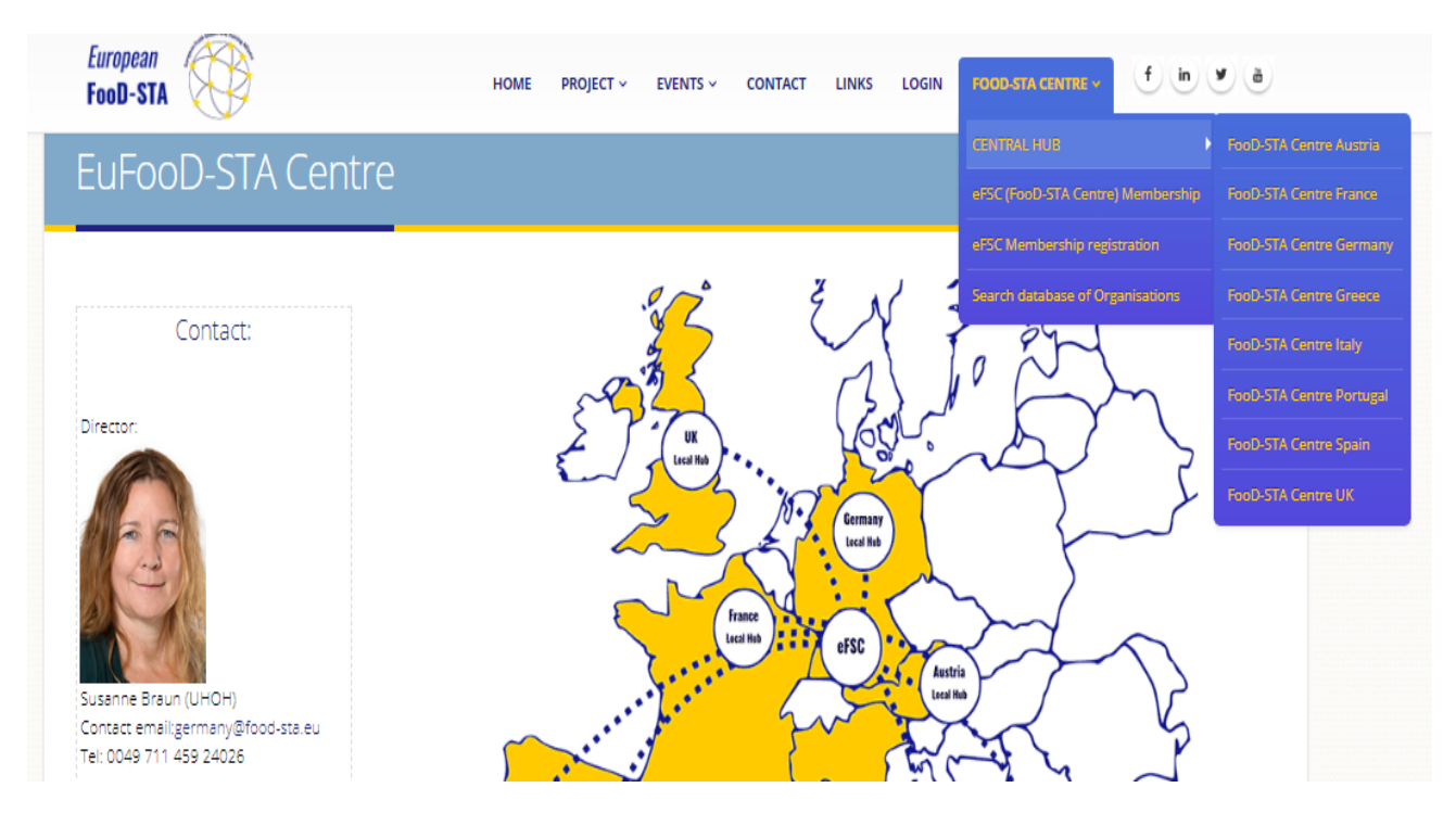
Figure 3. Screenshot of the access of the 8 local hub sites

Within the EuFooD-STA web platform (<a href="https://www.food-sta.eu/efsc centre hub">https://www.food-sta.eu/efsc centre hub</a>), 8 different sub-sites for the corresponding EuFooD-STA local hubs have been established. These dedicated sub-sites present a general text (functions, objectives) in English and also in the corresponding national language. The different local hub sites can be reached by clicking directly on the corresponding country in the map or by selecting it from the scroll-down menu (Figure 3).