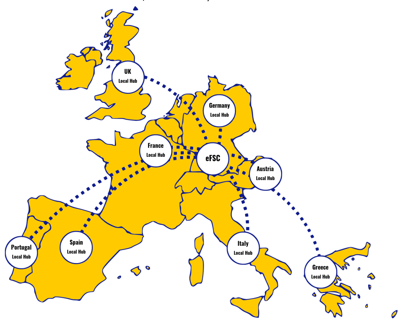
Figure 1. EuFooD-STA centre hubs

They will promote the project with leaflets, posters and/or presentations during national events where academia sector and/or food industry are involved.