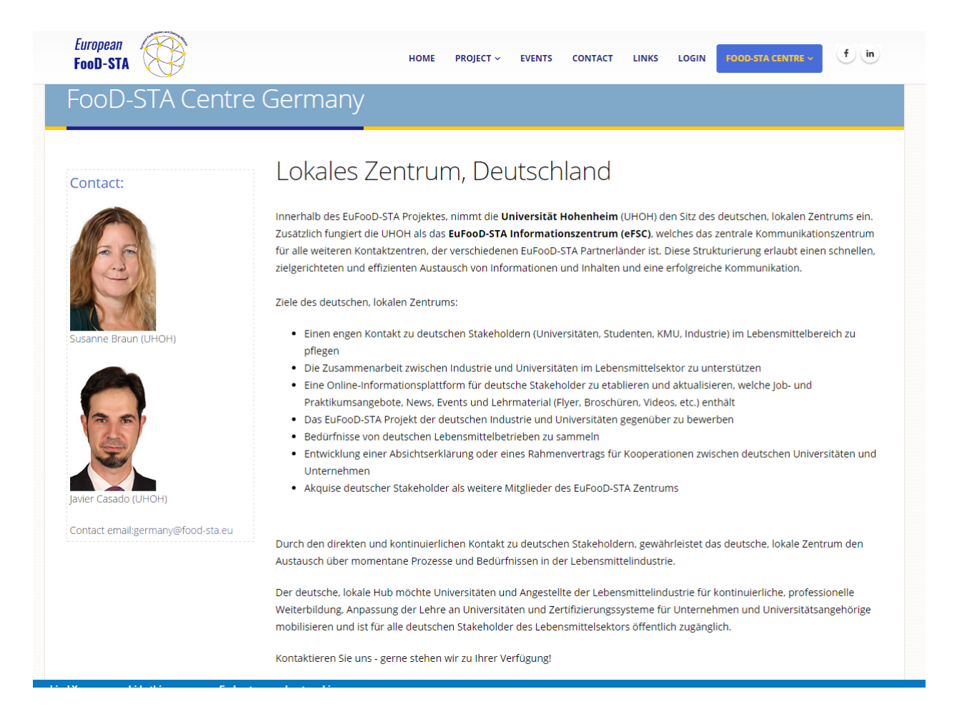
Figure 2. FooD-STA Centre Germany page

Two reference persons for each local hub will be nominated as editor to update and modify directly the content of their corresponding centre hub page.